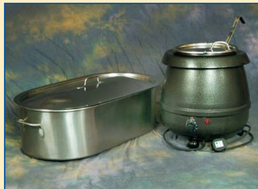
Fish & Soup Kettle