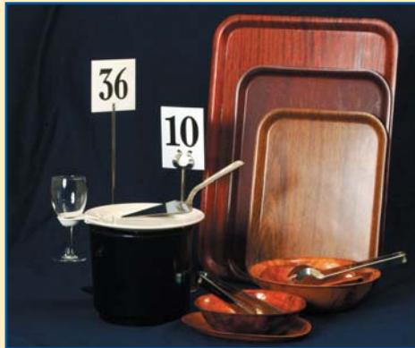
Assorted Trays & Table Numbers