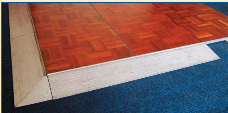
Parquet dance Floor - Indoor Use Only