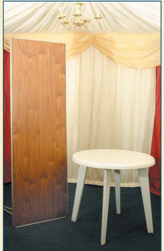
6' x 2' and Bistro Table