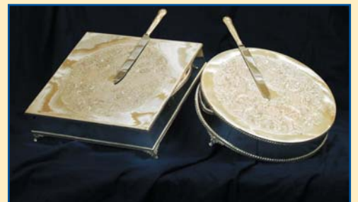
Cake Stand & Knives