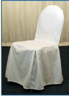
Banq. Chair and Cover