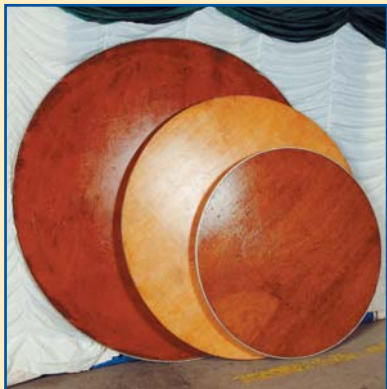
6', 5', 4' Round Tables