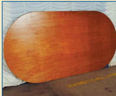
8' x 4' Oval Table