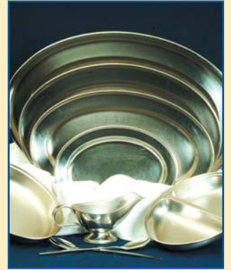
Stainless Serving Items