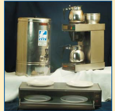
Urn & Coffee Maker