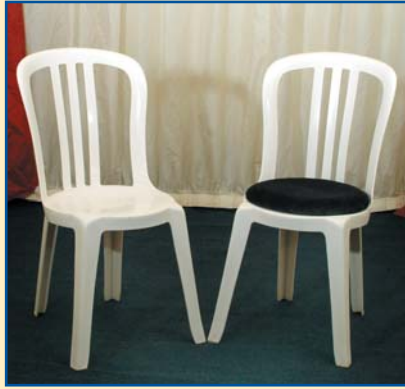
Bistro Chair and With Pad