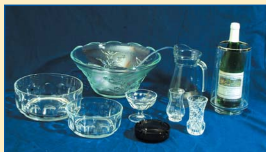
Glass Serving Items