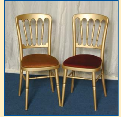
Bentwood Chair Gold or Burgundy Pad