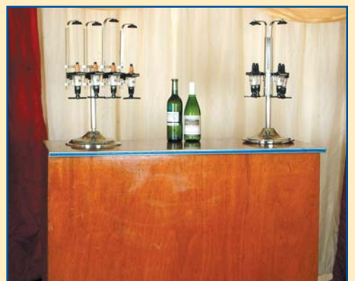
4' Bar & Optics