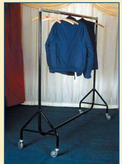
Coat Rail & Hangers