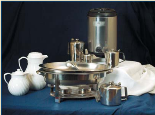
Hot Serving Items